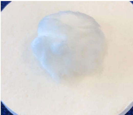
Take the required amount of cotton. You can make any shape you want.

It can be used to support refractory model with poor stability when firing, or porcelain inlays, Crowns and laminates can be placed directly on cotton and fired.