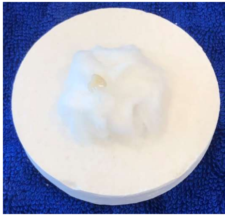
Can be fired directly on cotton, such as porcelain inlays.